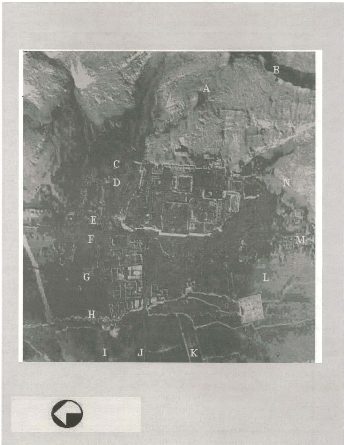
Figure 3- Persepolis. Processed air photo applying Laplacian 5x5 convolution and classification for enhancement of earth surface covers (mixture of limestone fragment, calcareous and argillaceous matrix). Red and dark bluish green color assigned to collapse residual material. Location numbers (A, B, C, D, E ...) referred to remnants of ancient guard wall and watchtowers.

علوم محیطی ۱۲، تابستان ۱۳۸۵ ENVIRONMENTAL SCIENCES 12, Summer 2006