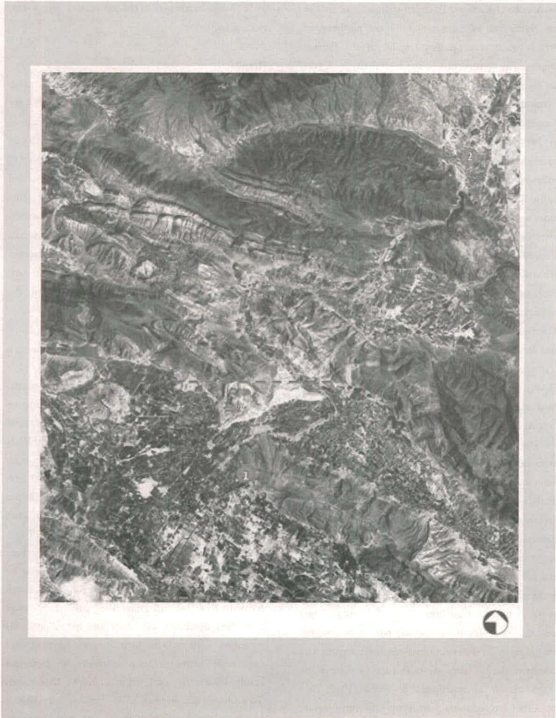
Figure 1- Parse-Pasargad region. Processed image indicating geographical setting, geological environment, geomorphological features, drainage pattern and vegetation covers of Farvardin and Marghab plains. The numbers indicate the locations of Perspolis (1) and Pasargad (2).