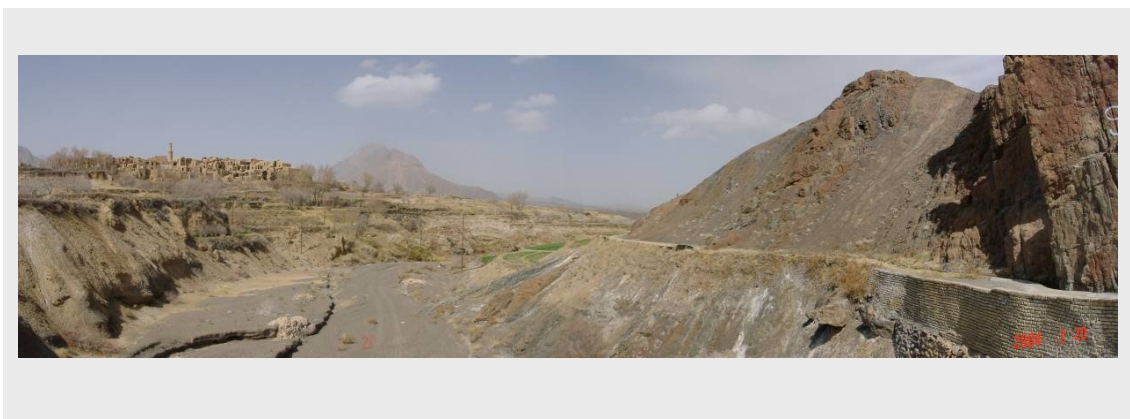
Figure 8. Kharanagh in Yazd; tacit knowledge serves place making and ecological approach relating to landform and environment.

Finally, she suggested that incorporating ‘cues to human care’ is the means to bridge the gap between a vernacular culture and ecological systems and emphasised that,