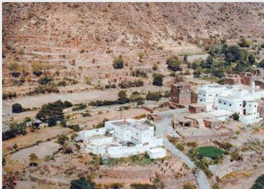
Figure 4. Al-Kase village in Saudi Arabia.