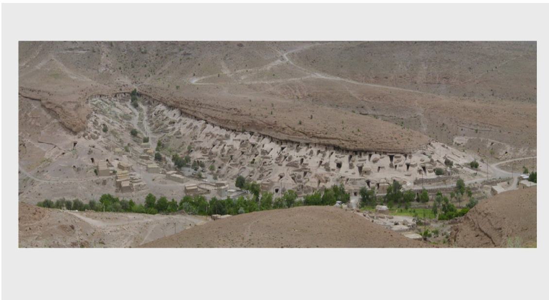
Figure 15. Environmental and sustainable place making, at Meimand, Iran. ( http://www.google.com )

Figures 13-15. Examples of environmental and ecological design in recent courtyard landscaping . (Author's personal collection)