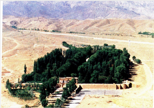
Figure 11. Shazdeh Garden: famous historic Persian garden in Mahan, Iran.