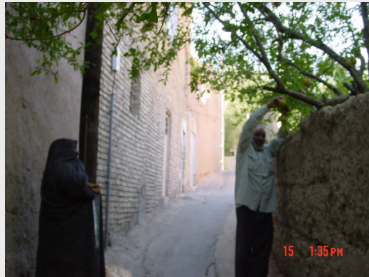
Figure 9. Enclosed, beneficial and shady pathway by living with environment in harsh climate at Taft, Iran.