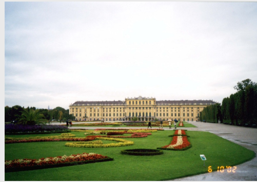
Figure 12. Schönbrunn Palace ,Austria, wide lawn landscaping with different concept. (Author's personal collection)

Finally, vernacular landscape architecture and its planning for sustainability, function, comfort and beauty can continue to serve new movements of landscaping and environmental design, in rural settlements and developing cities. These include the patterns of dividing farms and gardens by native edges, shady alleys, signing natural elements and vistas, fitting waterscape, managing irrigation and landform in landscape, use of regional materials and the importance of texture and color.