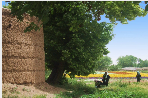
Figure 10. Example of an Enclosed Garden and supporting huge adobe walls for cultivating flowers at Mahalt, Iran.

For example, in the context of Iranian culture, art, architecture, and landscape architecture, as a sub-field, proceeds by using a known body of forms. This body is consistent with a vocabulary of shapes, a variety of hidden cultural controllers, which have their roots in religion, and by the application of ideas concerning their use and manipulation with people's participation. Beyond this, is unity and "Human's deep attachment to Nature and presence of the unseen world, gives rise to an assumption of nature as a Garden with evident signs and inferences of an invisible Gardner" (Nassr, 1377).