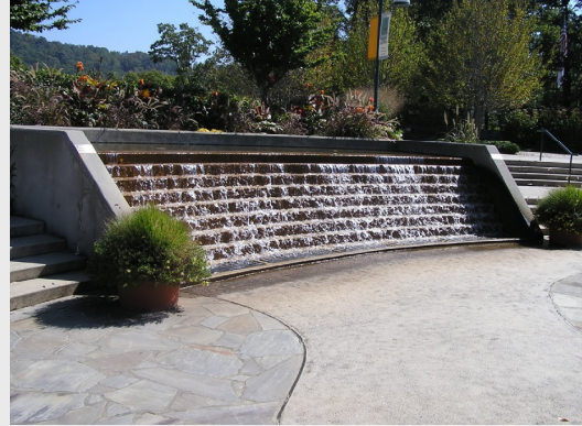
Figure 3. North Carolina Arboretum, USA, built cascade in Main Square and entrance. (Author's personal collection)