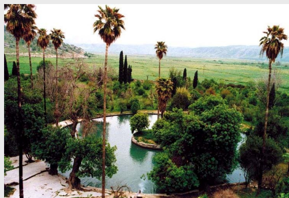
Figure 1. Cheshmeh Belgheis garden in Khozestan, is a good example of ancient Iranian culture, paradigms and landscaping. (Author's personal collection)