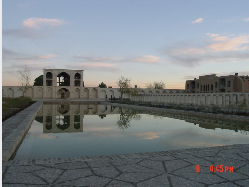
Figure 2. Dolat Abad garden in Yazd, with shallow and big pools and long channels both for irrigation and presence of water in central Iran.