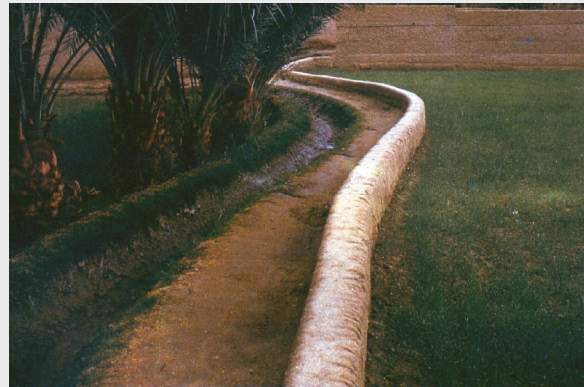
Figure 7. Way and irrigation channel between gardens in Tabas (Daneshdost, 1369).

I accept the idea of “complex ecological aesthetic” (Egoz and Bowring, 2004) but I wish to develop this idea from the farming and postural context to a variety of classic gardening and landscaping of old rural or suburban areas of Iran 3 . Although we tend to accept these landscapes and potentials as ordinary or specific cultural landscapes that have evolved through time, “these landscapes have to be, in fact, carefully designed and developed. By design, we mean the intended articulation of space and materials to create a landscape that answers functional needs” (Egoz and Bowring, 2004: 64).