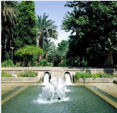
Figure 6. Golshan garden in Tabas (Daneshdost, 1369).