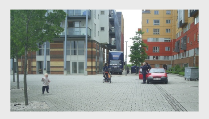
Figure 4. Visual, Social and Temporal connectivity in GMV