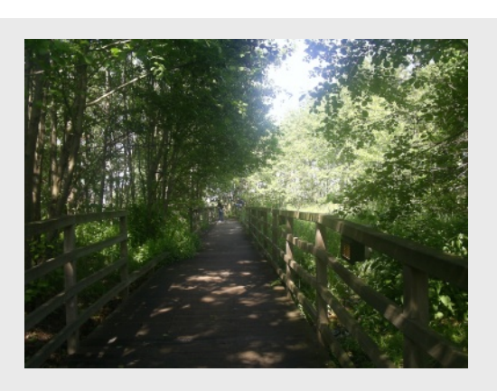
Figure 7. Ecology Park