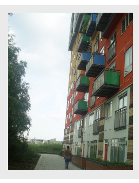
Figure 8. Human scale

علوم محیطی سال چهارم، شماره سوم، بهار ۱۳۸٦ ENVIRONMENTAL SCIENCES Vol.4, No.3, Spring 2007