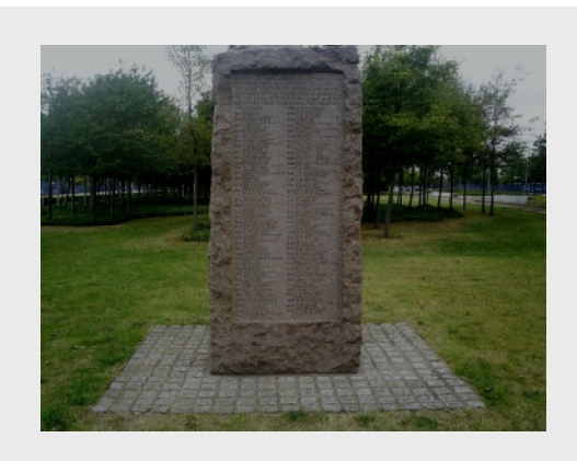
Figure 6. Monumental stone

•Human scale: As GMV has been principally designed for the pedestrian and gives priority generally to people over cars, and it works for the people, the Village is human in scale. Although GMV has high buildings, but different colours break the height and it seems human in scale (Figure 8).