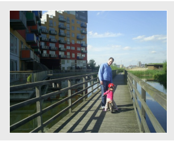
Figure 9. Visual access

•Visual access: Every thing is clear and visible in urban spaces, GMV. Users have a good visual access especially to the River, Ecology and Central Park, Open spaces and all other urban spaces. So, no one has privacy in urban spaces, in GMV, except when man is only inside of his-self or his house (Figure 9).